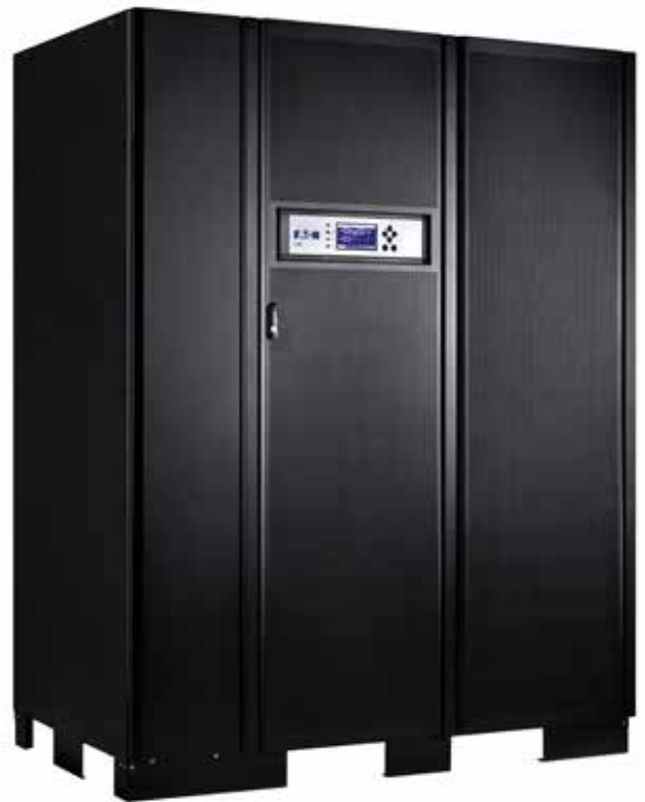
93E 15-400 kVA