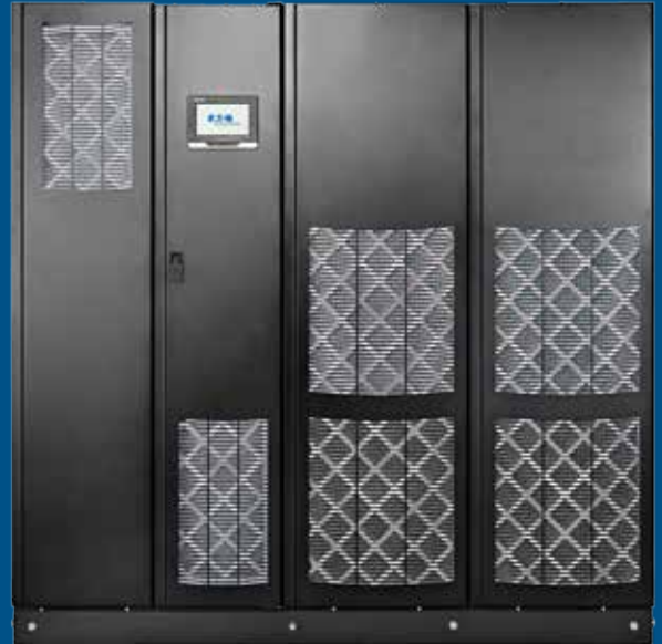
Power Xpert 9395P